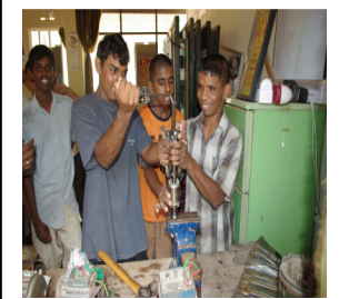
Students at Saviya Development Foundation

Establishing and providing financial assistance for a vocational training centre for differently-abled school leavers at Saviya Development Foundation at Matara. The assistance was mainly for providing IT equipment and tool kits for the students in order to further their development in vocations such as electrical motor winding, thereby enabling them to be meaningfully employed.