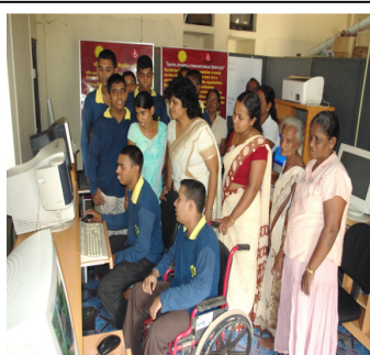
Equipment for disabled

LSF funded a handicapped police officer to conduct IT workshops for disabled servicemen. The objective of the project was to assist disabled servicemen to attain skills in IT so that they can seek employment conducive with their physical condition.