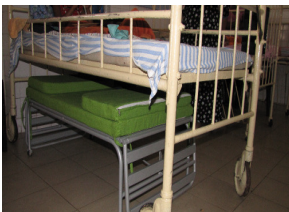
Folding Beds for Lady Ridgeway Children's Hospital (For carers of sick children from remote areas)