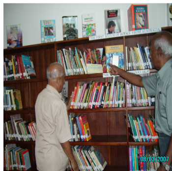
Books catalogued and used at Bodhi Gnana Library, Kalutara

LSF facilitated the collection and shipping of over 25,000 used quality text books from Australia to a community library – the Bodhi Gnana Library, Kalutara. LSF would not have completed this mammoth task if not for the tremendous support given by various individuals and organisations. As evident from the photograph, the books are being put to good use.