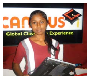
Two of the students who received the laptops

The Information Systems Department of BOC Ltd donated 7 used laptops to Lak Saviya Foundation in June 2015.