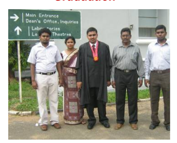
Students at Kahawa Ratanasara Maha Vidyalaya