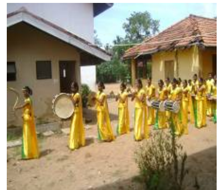
Kahawa Rathanasara MV Band

Using funds raised by Year 10 students from Sydney Boys High School a school band was set up at Kahawa Rathanasara Maha Vidyalaya, with the approval of the Principals of both schools. Funds were provided for musical instruments, uniforms and an ongoing salary for a Performing Arts Teacher.