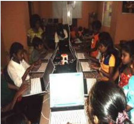
Lak Aruna children with laptops

In November 2011, LSF donated 10 laptop computers to the Lak Aruna Foundation's IT and English Education Centre in Hingurukaduwa, Passara – a remote rural village in Uva Province. Currently over 100 students from the area use the learning facilities of this Centre. View details on http://www.youtube.com/watch?v=hw1Z1kKG40w