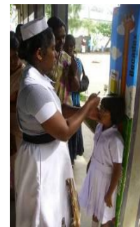
Clinics for children with disabilities