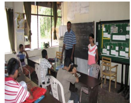
Teaching Electrical Wiring