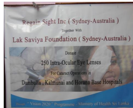
Handover of 250 intra-ocular eye lenses to the Vision 2020 Program of Ministry of Health