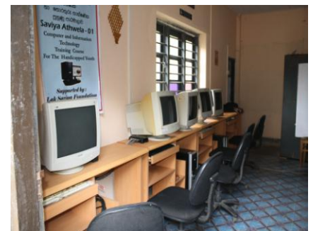
Computer Room by LSF