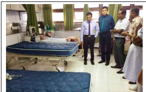
Beds donated to Nikaweratiya Hospital