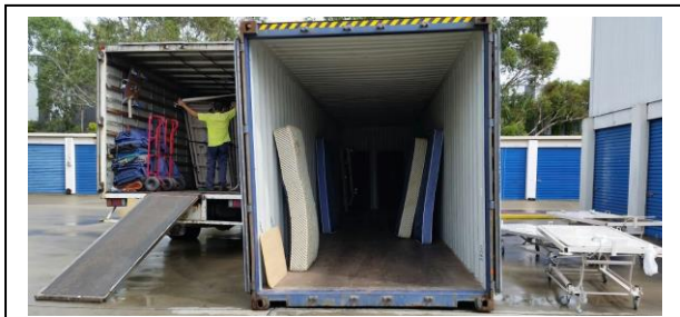
Beds loaded to container in Sydney

Friends and well-wishers in Australia $2,070.00 Friends and well-wishers in Sri Lanka $ 682.00 Proceeds from LSF Charity Dinner 2016 $2,703.00