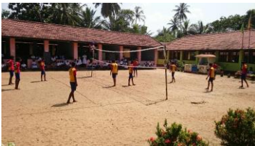
School Sports meet