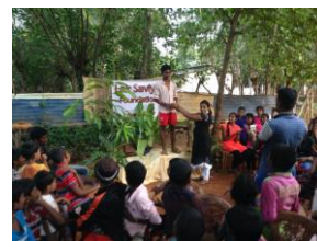
Sports meet Mylankaadu