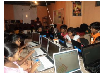
Students at Lak Aruna Education Center

Lak Saviya Foundation has been assisting this Centre since 2003 by providing computers, books, teacher salaries etc, and in 2012 funded the construction of a proper building to accommodate the growing number students at a cost of A$ 50,000. Current enrolment is over 400 students. Two of the youths from Hingurukaduwa have been provided with training opportunities in an IT company in Colombo, through LSF.