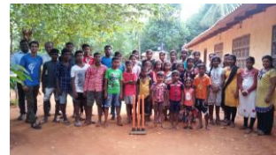
Children in Mylankaadu

Rs 50,000 was provided to buy school bags and stationary for 50 needy students in Jayasiripura Maha Vidyalaya, North Central Province. This was managed by a member of Lak Saviya Foundation in Sri Lanka.