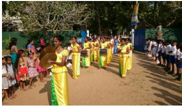
School Band funded by SBHS