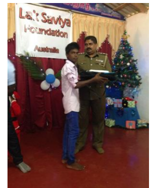
Distribution of bags and books - Mylankaadu