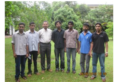
Some scholarship recipients

If you wish to sponsor any of these students in the waiting list please write to scholarships@laksaviya.org.au