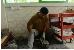
Making Prosthetic Feet